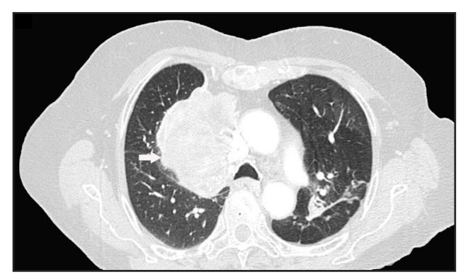
Figure 1. Computerized tomography of the chest with contrast. Mass in the right upper lobe of the lung measuring 8 by 6.4 cm, projected towards the hilum of the lung and mediastinum.

Lung cancer is the most common cause of cancer death and contributes significantly to the burden of disease (1). It is associated with bone metastases in 36% of cases, and cranial metastases in